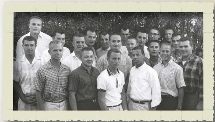
Delta Beta of Beta Theta Pi 1959